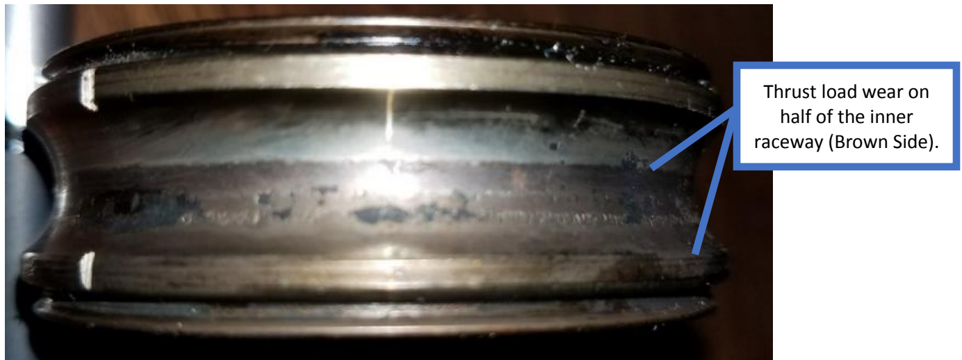
Figure 1: Excessive Thrust Load on the Opposite Drive End Bearing

Possible Solution: When mounting the motor on the machine, ensure that the motor shaft and machine mating part is clean and has no burrs. Use an anti-seize to mate the motor shaft and the machine mating part together. When pushing the motor into the mating part of the machine, ensure that the motor is not cocked at an angle to avoid bending the shaft or damaging any other components. Also, ensure that the machine is not overloading the motor or pulling on the motor shaft axially by adjusting the mating couplings with correct spacing.